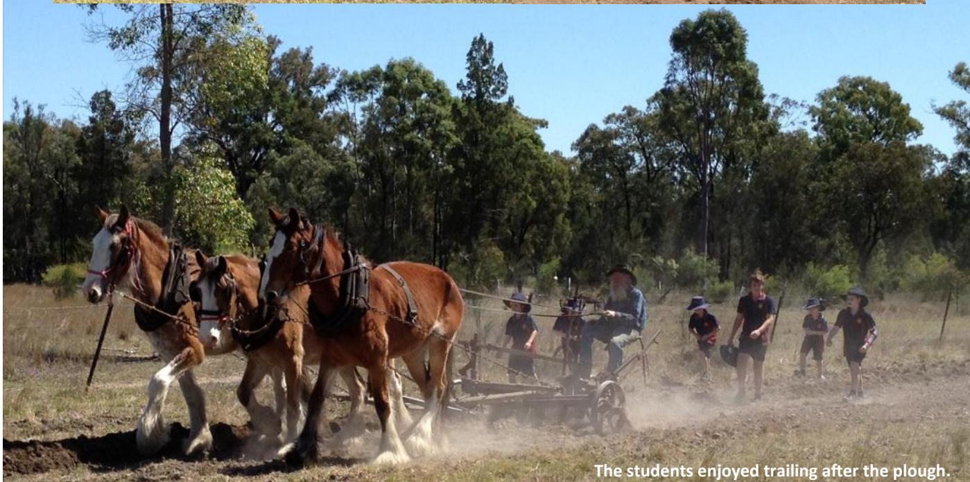
The students enjoyed trailing after the plough.