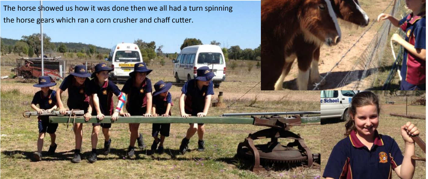
The olden day slasher.

The horse showed us how it was done then we all had a turn spinning the horse gears which ran a corn crusher and chaff cutter.