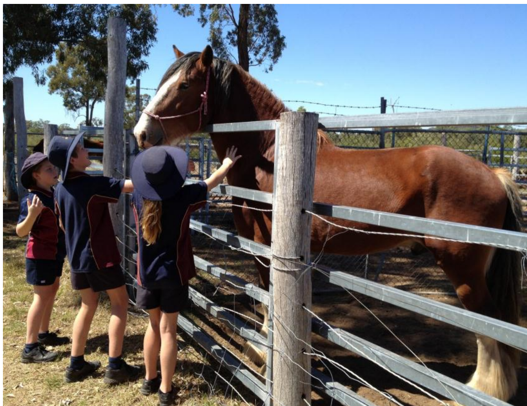
Trimmer the stallion enjoying a pat.