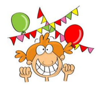
YPS students and friends having a blast at the 5/6 Fun Day!