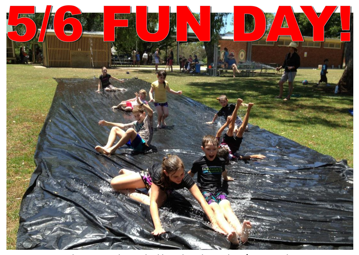
What a great day we had last Thursday at the 5/6 Fun Day! Thanks to the parents and the Tharawonga kids for joining in the fun.