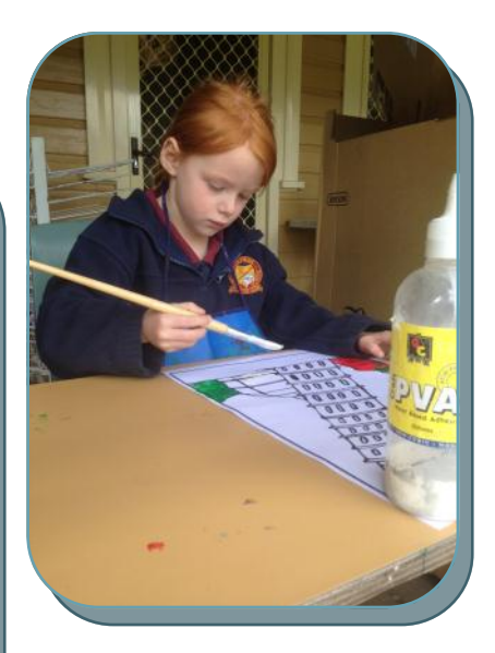
The K-1-2's painting the Leaning Tower of Pisa in Art - part of our Italy study.