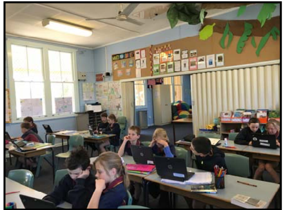
Concentrating on writing our newsletter reports!