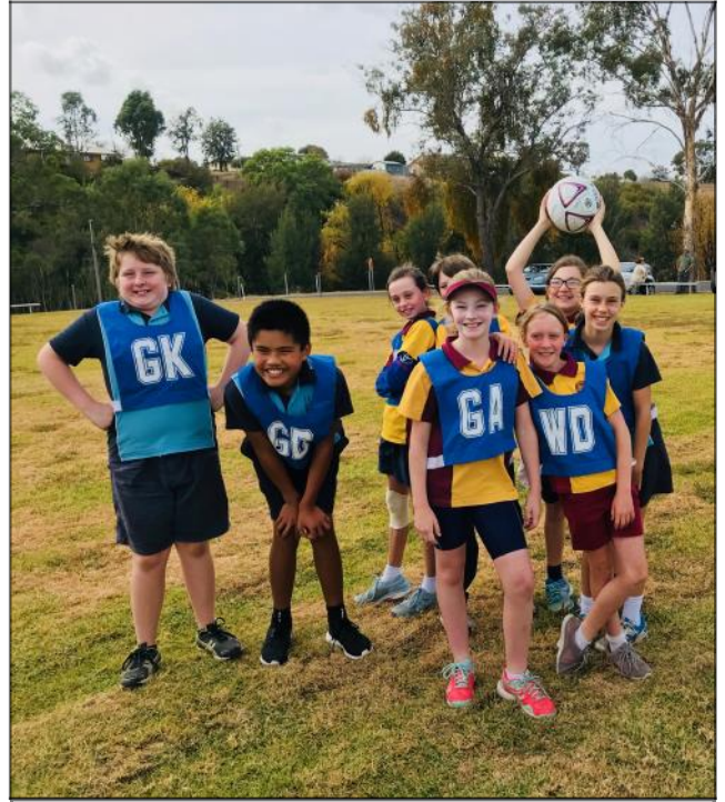
Netball Gala Day in Inverell - Yetman students joined with their Bonshaw friends to play in the competition.