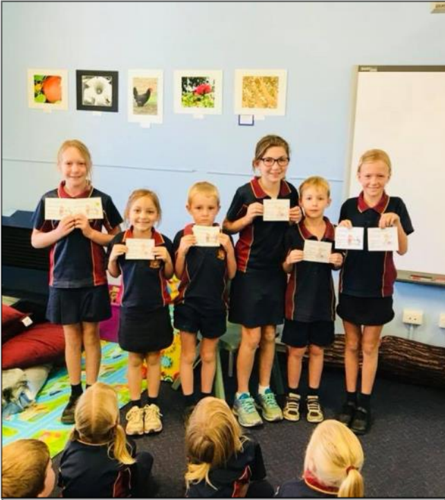
Week 4 and week 5 You Can Do It winners for Getting Along and Organisation.