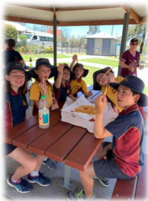
Swim School 2019