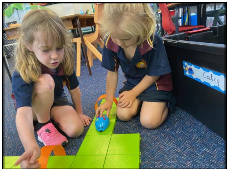
Coding in the All Stars classroom