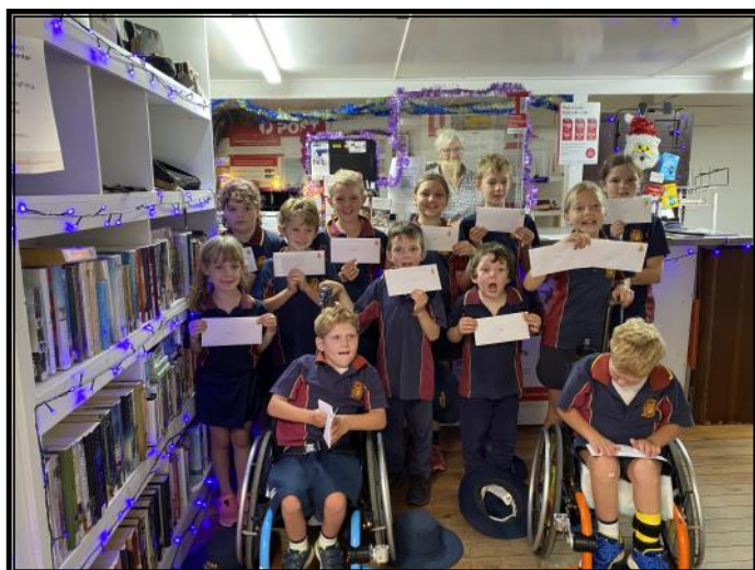
Posting our letters to Santa