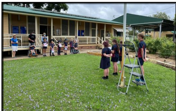
Remembrance Day ceremony