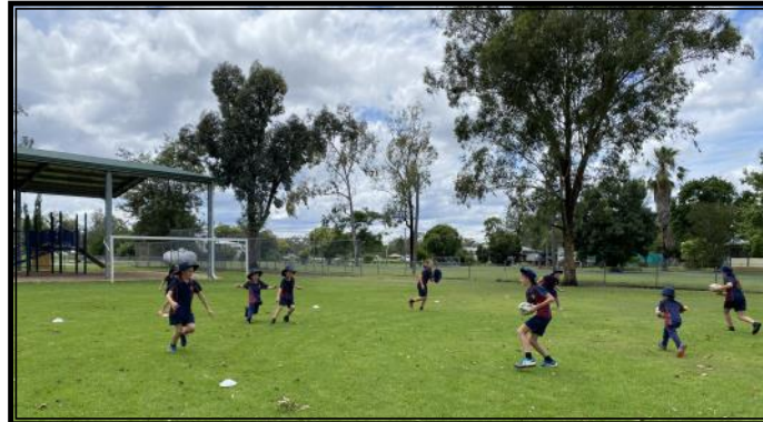
Rugby League clinics