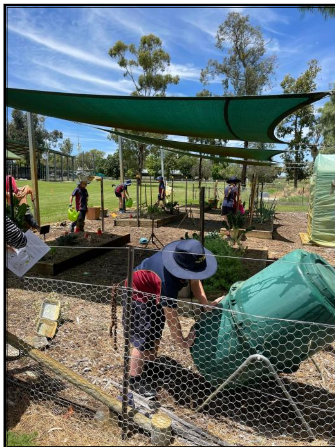
Working in the garden