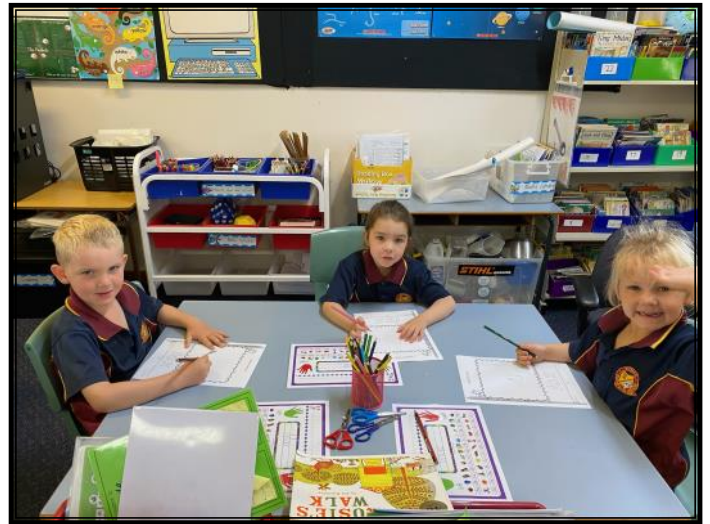
Three of our transition students for 2022