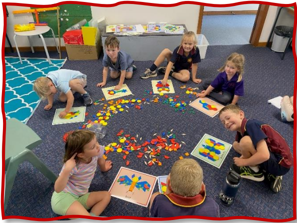
Maths activities with our Tharawonga friends