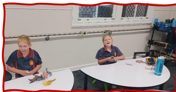
New classroom furniture