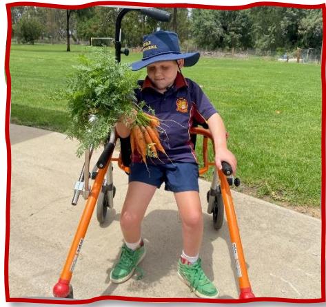
The carrot harvest!