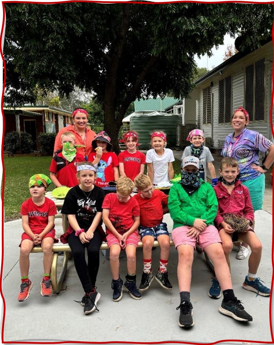
Years 3-6 making damper in English