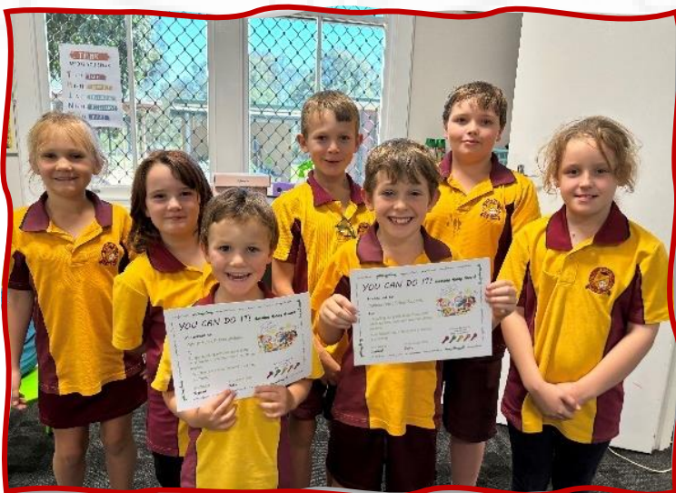
You Can Do It! Getting Along