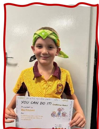
You Can Do It! Confidence